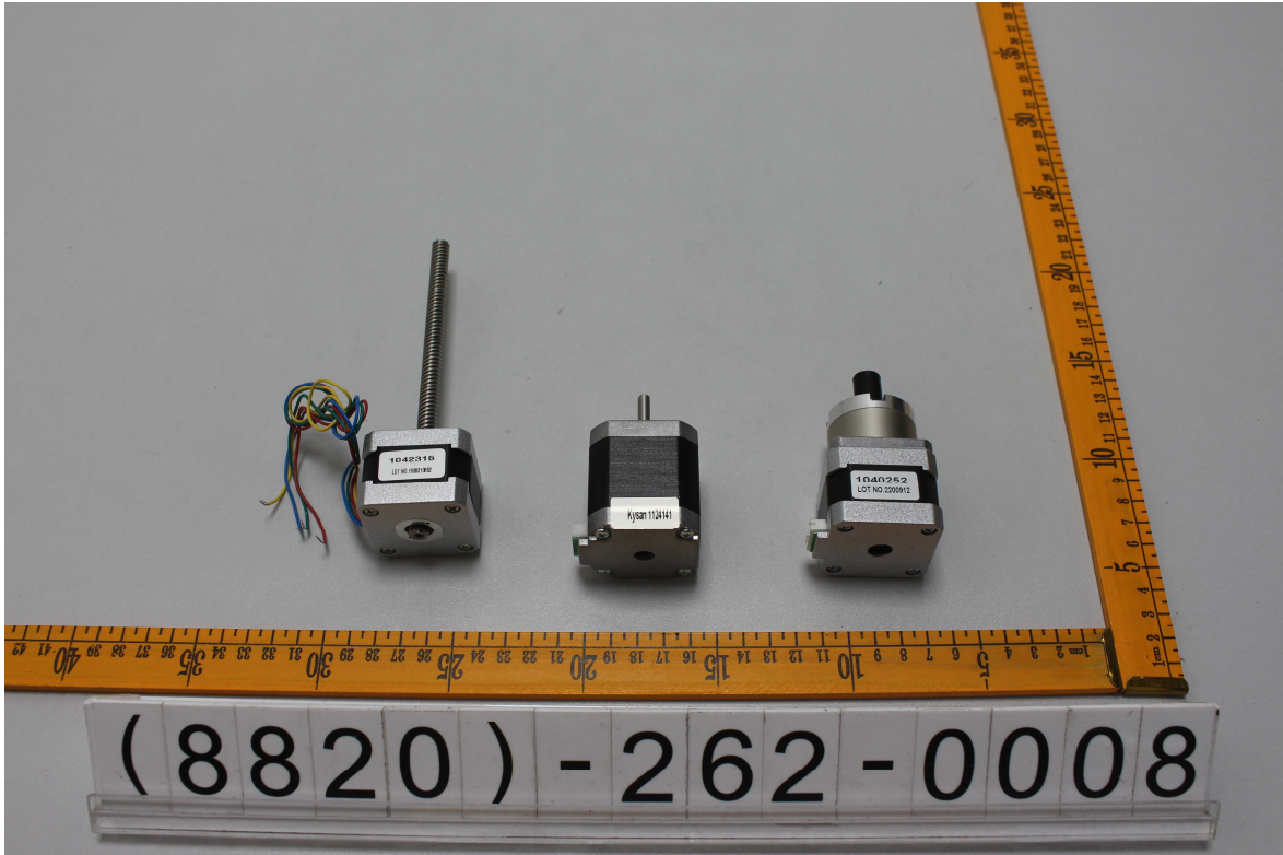
Photo of the Submitted Sample